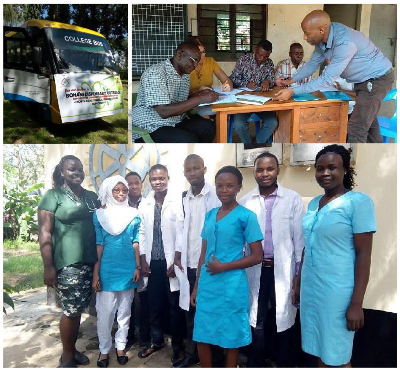
The local clinic. Left – The school bus is often used during outreaches. Right – Signing the collaboration agreement. Below – Students on attachment in Bomani