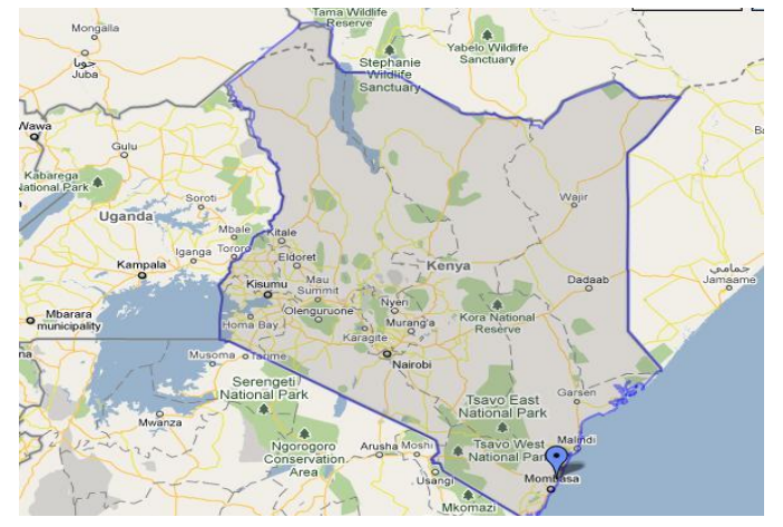
CHPF is located at the blue balloon

P.O. Box 1045 - 80109 Mtwapa Kenya Telephone: +254 702 217 212 www.chpfund.org