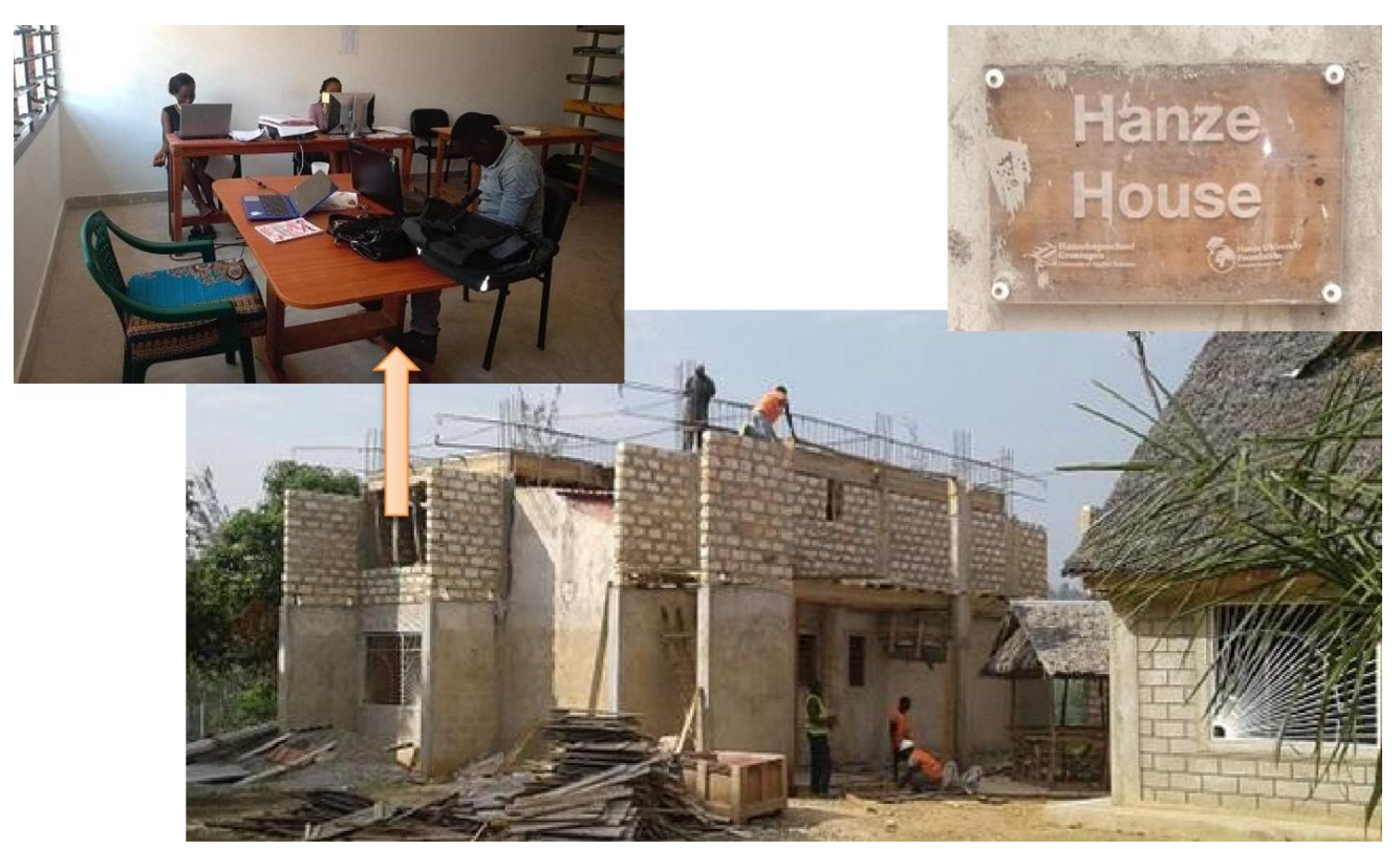
Hanze House: Below: Under construction. On top: In use!

The year started with intensive collaboration with Hanze University of Applied Sciences in Groningen. A team of 22 Hanze employees came to Kenya in February-March. Part of the team participated in the construction of a new floor on the "Hanze house" and an extension of the hostels, and the other part of the team participated in the development of teaching methods and techniques. For two weeks they worked together with North Coast MTC staff in construction, in the classroom, and sometimes also in the library and in administration. These were fantastic and intensive weeks with a lot of exchanges and continued e-mail contact in the remainder of the year. We hope that friendship and cooperation will not be limited to 2018 but will continue for many years! Fortunately the signs of this are favorable; in the beginning of 2019 we received three of them already again for a visit!