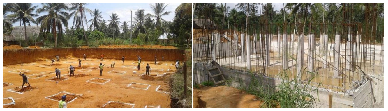
The first phase of the construction of a new tuition block with four floors

first floor in any case. In addition to these major new projects, the laboratory was also completed in 2018, a skills lab room was set up for the new dialysis training, the library was air-conditioned, and various seating areas were created outside to create more space for the students to join in groups being able to work without having to drag all the chairs and tables from the inside to the outside! Furthermore, the school again received a lot of material support from various universities and libraries in the Netherlands, through the Hanze group, and through various individuals, books, microscopes, prostheses and other medical materials were donated to the college. In addition, the library in the school at the end of 2018 also received an additional, very pleasant expansion. Through the Kenya National Library Services, we received 300 new medical and nursing books from Book Aid International. The college contributed through paying the import costs, but otherwise received the books themselves for free. The librarian is currently busy with including all of them into the library system.