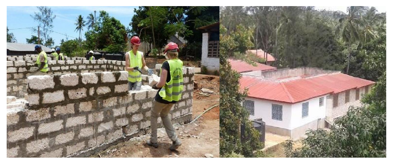
Expansion of the hostels: Left – the walls are going up. Right – the new extension in white seen from the roof of the Hanze house.