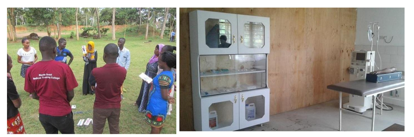
Activities during Bridges of Hope training