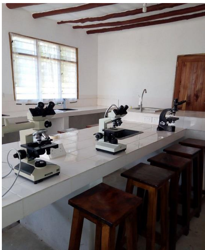
The almost ready laboratory with some of the acquired microscopes

At the end of 2016 we received support from Wanawa Foundation, “Stichting OntwikkelingsSamenwerking De Ronde Venen” and the Wild Geese Foundation to complete and furnish the Community Health and Education Center (CHEC). We completed most of this work in 2017. The project was to be completed by September 2017 various factors caused some delays. However, by the end of 2017, almost the whole project was completed with only the purchase of some medical equipment for the laboratory remaining. This will be completed in the first quarter of 2018. Aim of the project is to ensure that pregnant women from the surrounding community get easier access to recognize possible pregnancy problems early. In addition, we also want to help to improve the care for the chronically ill. The laboratory will be able to offer some specific tests. In addition, in the beginning of 2017, a collaboration was started together with the Dutch Rotary Doctors and the public dispensary in Bomani to improve care for people with diabetes and hypertension. However, the clinic had start-up difficulties due to the strikes