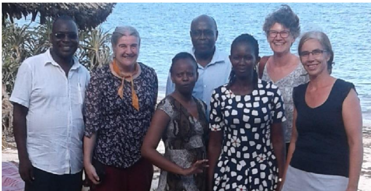
The trainers of the “Enabling learning” course

A team with staff members of the Hanze University of Applied Science will visit North Coast MTC for two weeks at the beginning of March. Twelve of them will coach the college staff on competency based education; nine others will assist with the construction of extra accommodation at the school. Besides those direct objectives, it will also be a period to exchange many many other things – everyone is looking forward and exchange has started extensively already on the Whatsapp!