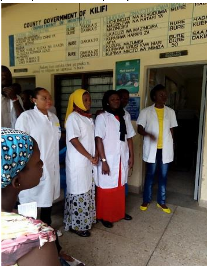
North Coast MTC students ready to assist during the “pregnancy care day”

In September, CHPF and North Coast MTC collaborated closely with “Mama na Mtoto” a British NGO which aims to improve the mother and child care at the local dispensary. As an initiation of the same, in September and October, an underground water tank was built, the incinerator (for potential infectious waste) was repaired, and a placenta pit was dug. In addition, an open day was organised for pregnant women and their partners, where several informative sessions were conducted (about pregnancy, delivery, recognizing signs of (sexual) abuse in children, contraception) and where babies and pregnant women were assessed. The day was a big success, more so because many women were already far in their pregnancy but had never attended antenatal clinics because of the closure of public health facilities. We are exploring how we can continue to improve the care for children pregnant women at the facility and how we can help to improve the knowledge among the population, and specifically the youth, about pregnancy, menstruation, and contraception.