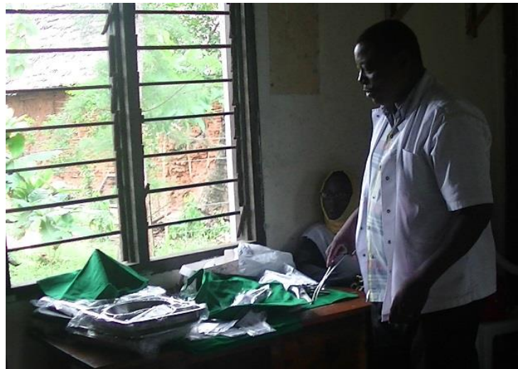
Issuing of delivery sets to a public dispensary in Bomani

Thanks to the generous support of the “Stichting Voeten in de Aarde” and the “Stichting OntwikkelingsSamenwerking De Ronde Venen” this project was a huge success! In consultations with the hospitals a total of 26 basic sets for deliveries were purchased and issued to the three hospitals as well as two smaller medical centres. Also, 12 sets with extra materials (for stitching etcetera) and some other related equipment like suction machines, weighing scales, waterproof aprons etcetera were donated.