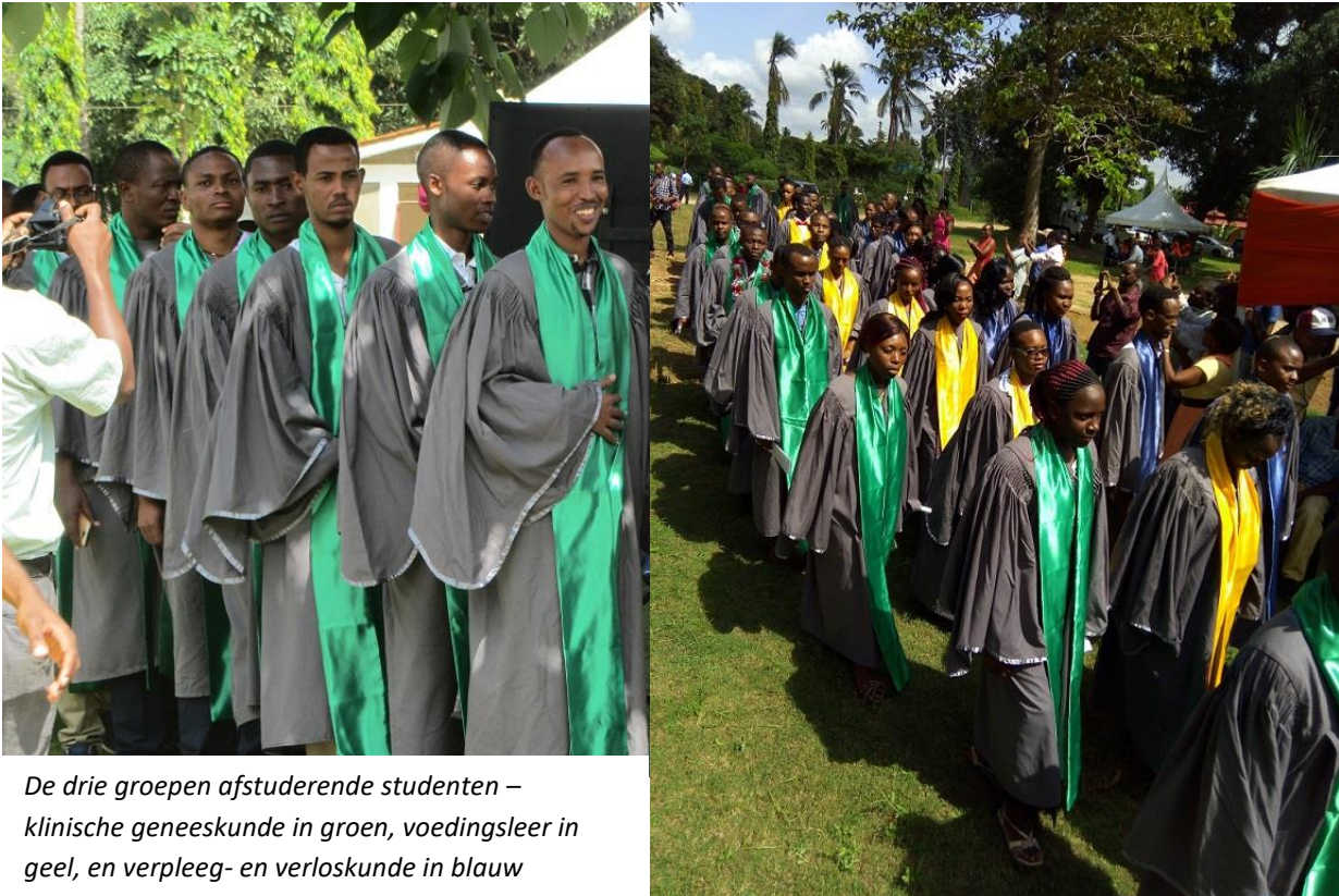
De drie groepen afstuderende studenten – klinische geneeskunde in groen, voedingsleer in geel, en verpleeg- en verloskunde in blauw

het nationale examen en bovendien scoorde één van onze voedingsleer- studenten het hoogste cijfer in het nationale examen. Het nationale examen voor verpleeg- & verloskunde is wat anders georganiseerd en bestaat uit vijf individuele examens. Ook dit werd heel goed gedaan; negenentwintig studenten haalden alle examens in één keer en zeven studenten moesten één van de vijf examens opnieuw doen en haalden dit allemaal in de herkansing. Naast deze drie opleidingen, waar we in 2012 en 2013 mee begonnen, zijn er twee opleidingen bijgekomen: openbare gezondheidszorg en een opleiding trauma en gipstechnieken.