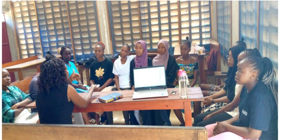
Figure 3: Monthly session with the dean and the 14girls

The monthly sessions also provide a platform for the girls to share ideas and learn from each other. The sessions also invite others speakers to inspire and empower the girls through different topics.