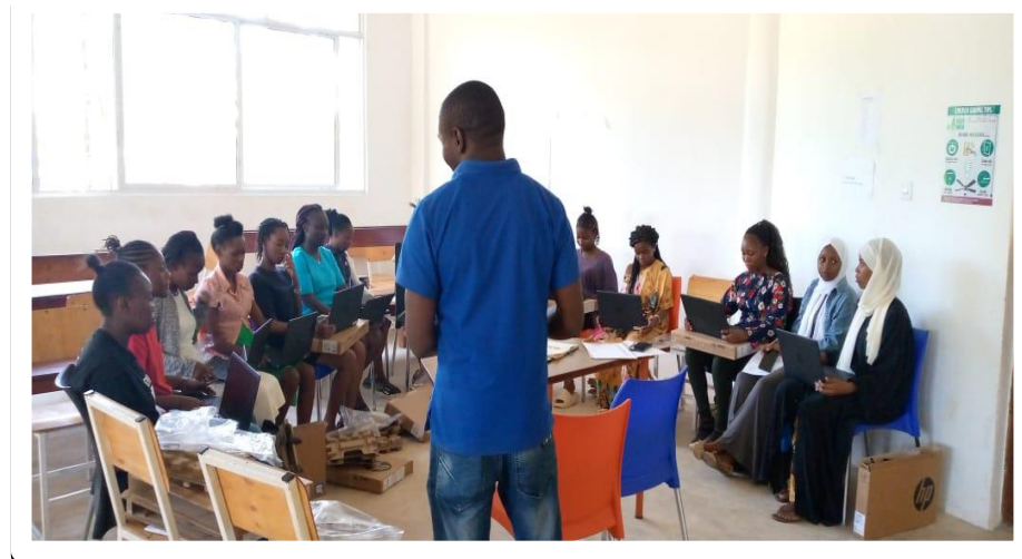
Figure 2: ICT officer give orientation to the girls as they receive their laptops

Mentoring and assessment of the girl's progress Seven monthly sessions have been conducted to mentor and assess the progress of the 14 girls. The sessions happen every second and