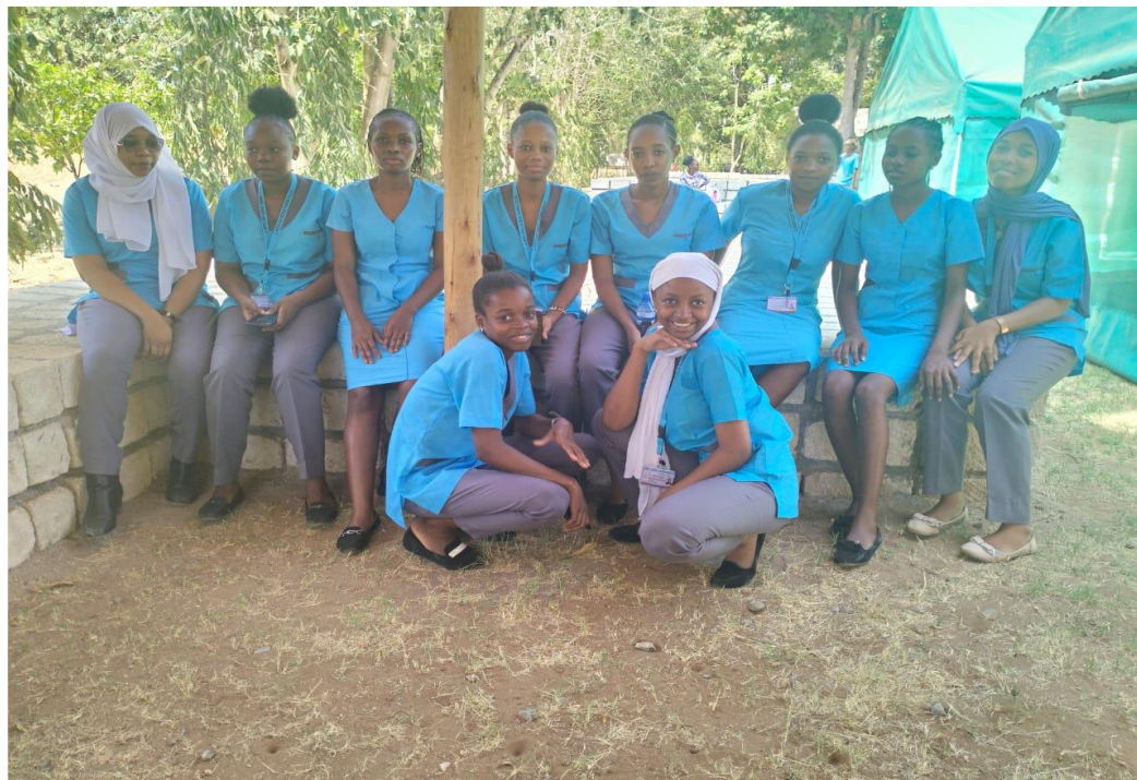
Figure 4:14Girls excited to receive their uniforms