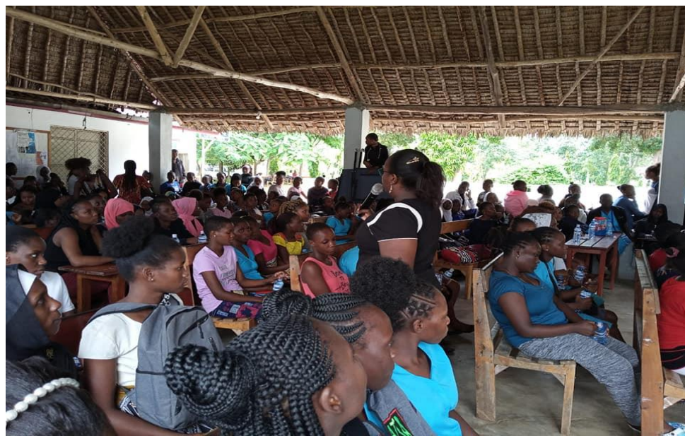
Figure 1: SEF Officer giving health talk during the girls talk